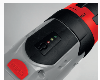
LED CHARGE INDICATOR